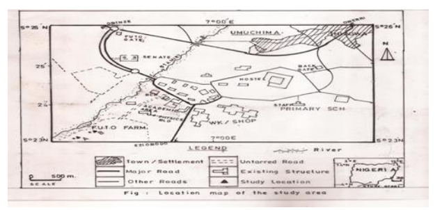
Fig 1 The location map of the study area

experimental plot was mapped out into nine treatment plots, each measuring 2 \times 2 m with inter plot distance of 1 m and replicated three times with inter block spacing of 2 m. The beds were manually tilled with hoes and spades.