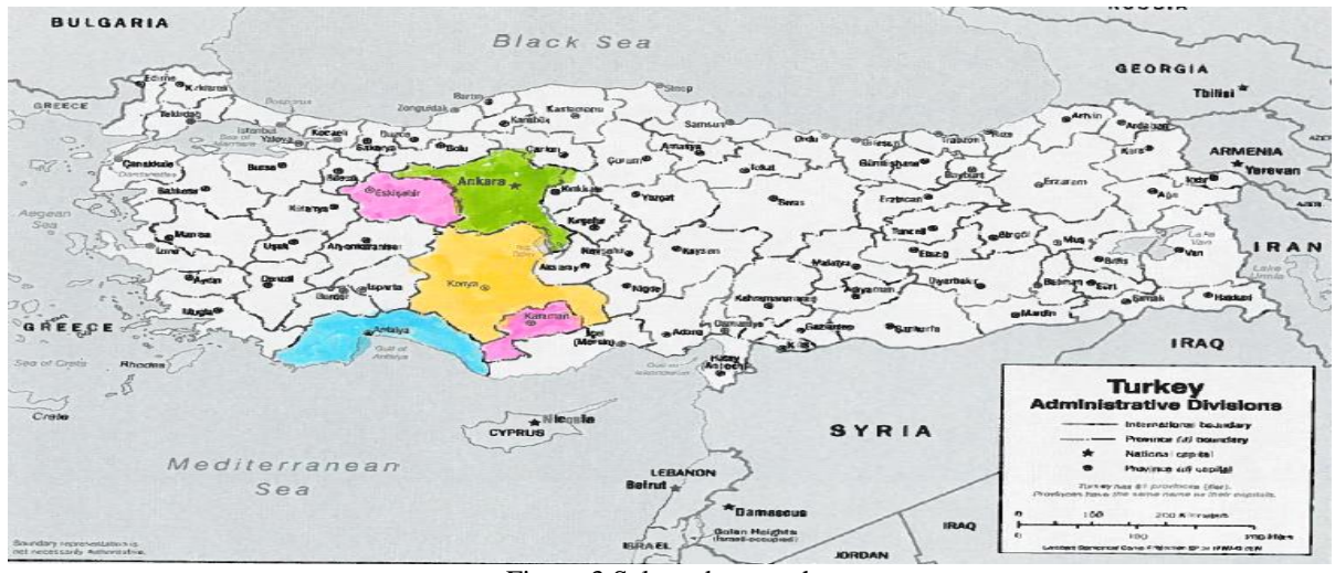
Figure 3 Selected research area

agricultural credit usage, and others are important also for credit and production patterns. All of them consist of approximately 15.2% of total agricultural credit amount at 2014 in Turkey according to Finturk database (http://ebulten.bddk.org.tr/finturk). Many production systems such as field crops, greenhouse and orchard, vegetable and animal production were applied at selected area. As part of the interview, farmers were asked to identify the criteria that they had used in selecting among the 11 banks offering agricultural credit. Table 2 summarizes farmers' responses. Low interest rate, eligible term, flexible payment plan, loyalty, location advantage, promotion and "other" reasons (e.g., willingness to work with the same banks, psychological and risky considerations, perception of public banks) were mentioned as the most widely used criteria.