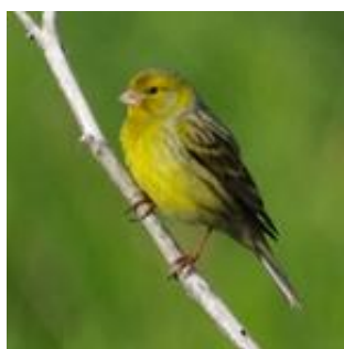
Figure 3. Wild canary