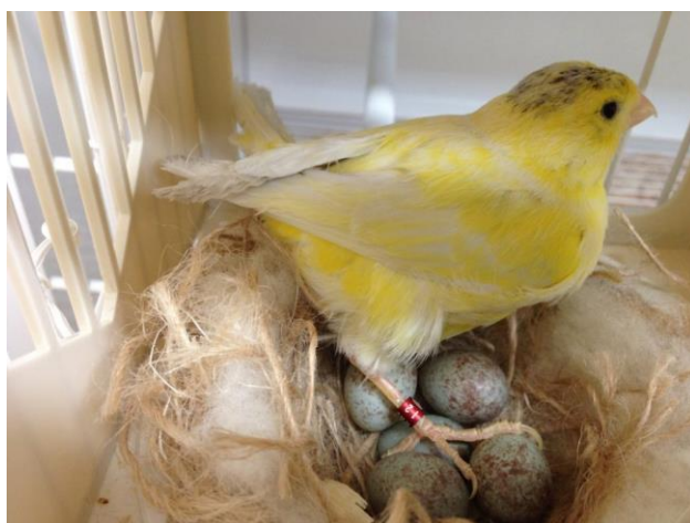
Figure 6. Female canary ready to incubate

The physiques of the cage canaries are different from wild one. Wild canaries are smaller and finer (Figure 3), but domestics are big (Unyayar, 2019) (Figure 4).