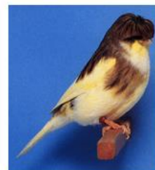
Figure 11. Form canaries