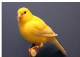
Figure 1. Domestic canary