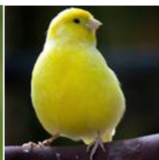
Figure 4. Domestic canary