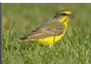
Figure 2. Wild canary