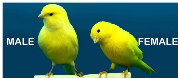
Figure 5. Male and female bird