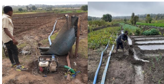
Figure 3. Schematic picture of irrigation practice of farmer (Photo was taken from irrigation farm lands in Haramaya District, Gabisa Village, 2019)

17.07% of carrot and 14.6% of chat. As seen in Table 3, House hold respondents produced crops that used to reduce food insecurity 40 (32.6%) 28.57% produce Aja, 42.8% produce potato, and 7.14% produce barley 24 (19.7%) produce Aja, Potato and Barely respectively. House hold respondents does not used irrigation, are generally produce 82.35% of Teff, 17.64% of wheat by utilizing or using rain fall, because of lack of adequate water, land inaccessibility and topography are made un favorable for irrigation practice.