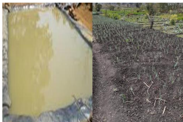
Figure 5. Schematic picture of water harvesting which have been using for small scale irrigation (Photo was taken from irrigation farm lands in Haramaya District, Damota Village, 2019)