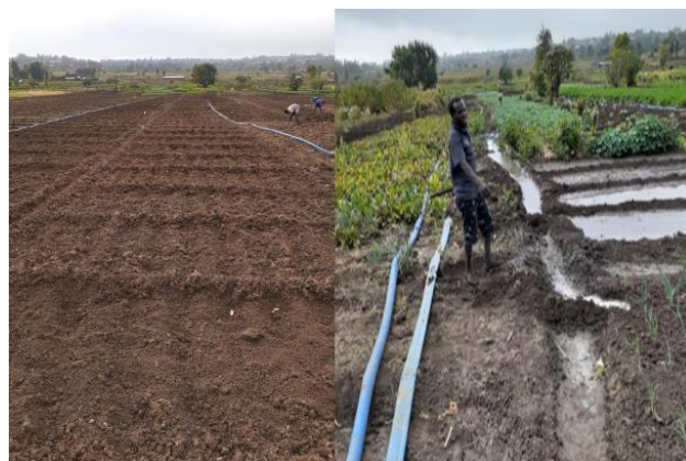
Figure 4. Schematic picture of irrigation practice of farmer (Photo was taken from irrigation farm lands in Haramaya District, Tuji Gabisa Village, 2019)