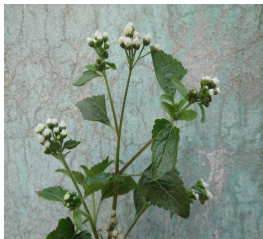
Figure 1 Blumea lacera plant

The epidemiological data were analyzed statistically by using Pearson chi square test with SPSS (version 16.0).