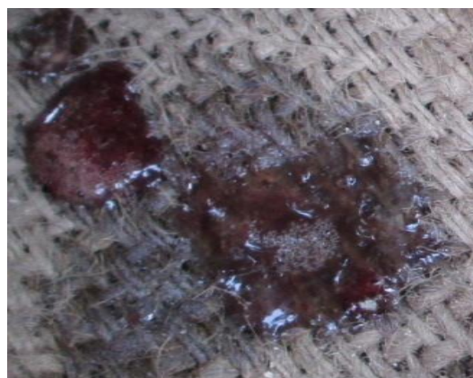
Figure 3 Blood from abdomen of affected animal