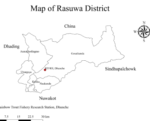
Figure 1. Administrative map showing location of the field experiment in Rasuwa district, Nepal.

Where, wi and wf are the initial and final mean wet body weights in gram, respectively.