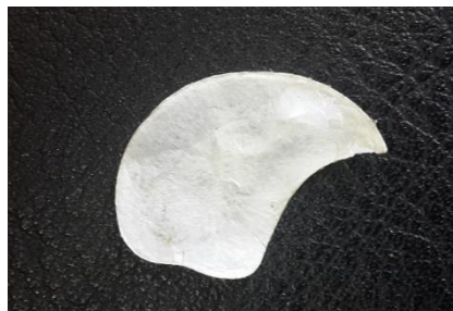
Figure 2. Epifragma Layer