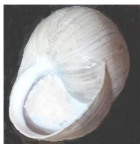
Figure 1. Epiphragmal structure formed in the aperture cavity

structure of H. pomacella and H. asemnis is separated from the aperture cavity as a whole piece (Figures 1, 2, and 3). E. vermiculata disintegrated the epiphragmal structure and separated it from the aperture cavity. However, H. melanostoma had an epiphragmal structure that was generally divided into 2-3 parts at the end of the hibernation. Comparing the weight and thickness of the epiphragmal structure by species at the end of the hibernation, the weight ( 0.025\pm 0.28 g) and thickness ( 0.125\pm 0.30 mm) for E. vermiculata were the lowest whereas the highest values ( 0.41\pm 0.26 g, 0.310\pm 0.22 mm, respectively) were determined in H. asemnis (Table 7).