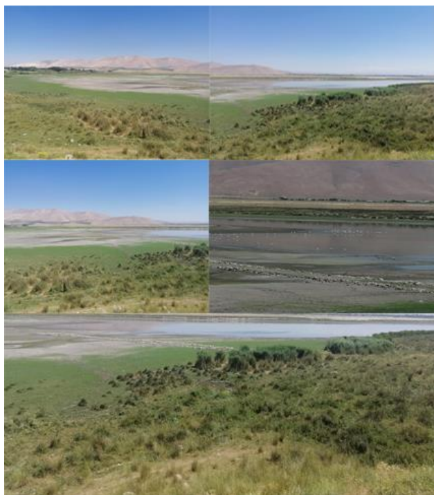
Figure 2. Photos from the study area

Recreation areas have a phenomenon that reflects the image, shape, culture and economy of the city and the country. Therefore, recreation area uses, designs and plans should be formed as a result of very good analysis. If careful planning and designs are not made, large losses and false image perception are created (Gök, 2011). Akkaya Dam Lake has a great potential in terms of recreation. Investments planned to be made in the area should be handled in a way that will have tourism and recreational activities and demands, taking into account the natural, cultural and social structure of the region.