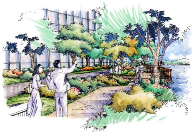
Figure 1. Hand drawn perspective image (Caling 2015)