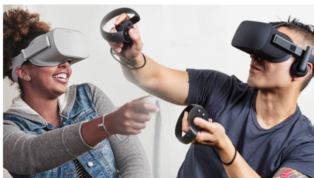
Figure 3. VR headset (Knapp 2018)