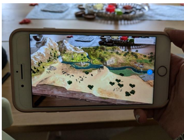
Figure 4. Using mobile phones for augmented reality (Stolyar 2020)

Virtual reality (VR) has become a mainstream term for referring to the creation and manipulation of a virtual world within a computer environment. With recent advances in computer technology, virtual reality images can be produced on a personal computer and it is possible to use virtual reality images as a medium for landscape assessment (Lim et al. 2006; Eve 2012). Nowadays, headsets that use computers or mobile devices as interfaces can be used to view VR images (Figure 3). Despite a lot of confusion, the concepts of virtual reality vs augmented reality are different from each other. Virtual Reality Systems were developed to simulate reality, by this users of virtual reality systems leave reality to browse an alternative reality generated by a computer system. Augmented Reality Systems blend together elements of reality with electronic elements generated by a computer system. Users can thus see real elements enriched with electronic information (Bimber O. and Rakar R. 2005; Kim G 2005; Cawood S. and Fiala M. 2008; Lopez et al. 2010).