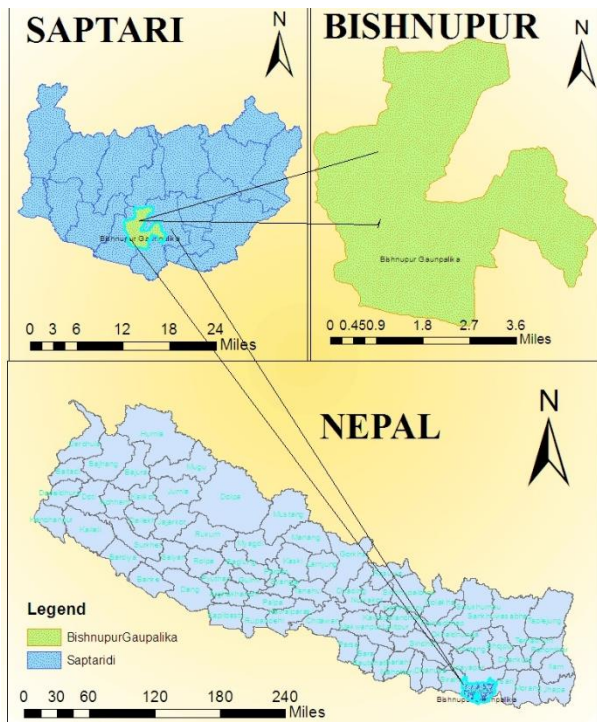
Figure 1. Map of Nepal showing the study area