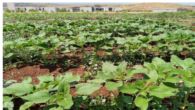
Figure 1. A view from drip irrigated sunflower