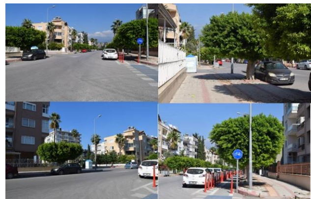
Figure 2. General views of the study area (Original, 2020)