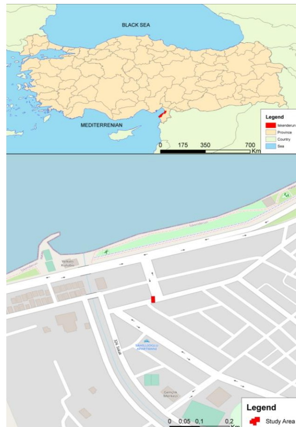
Figure 1. Location of the study area

December 2020. In the city, where the Mediterranean climate prevails, summers are hot and dry, and winters are warm and rainy. The study area consists of a part of Lala Mustafa Paşa Street, which has a building-sidewalk-road section in the city and has Ficus retusa-nitida species, which is also used extensively in the city landscape on its sidewalks. The location of the study area is seen in Figure 1 and the visuals of the general status of the area are seen in Figure 2. The buildings on both sides of the street are generally 4 floors and have a garden. There is a 2 meter wide pavement on both sides of the approximately 10 meter wide road and F. retusa-nitida with height and crown diameter of 3 meter planted at regular intervals. This species, which has a coarse texture and is always green, is used for providing shades.