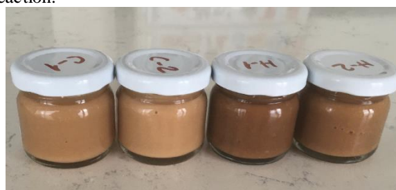
Figure 2. Photograph of produced DL samples (C1, C2, H1 and H2 samples in order from left to right).

In the Maillard reaction, some degradation products have been formed depending on the temperature and pH of food. In neutral or acidic foods, while if the initial sugar is pentose, furfurals form; if hexose, the formation of HMF takes place. In alkaline foods, it consists of reductones and fission products such as acetol, pruvaledehyde, and diacetyl. All these released Maillard reaction products are very reactive and play an important role in the next steps (Villamiel et al., 2006). Because of the reactivity of HMF, it can easily transform into other compounds. Moreover, this might be due to fact that HMF was not only formed from the Amadori compound but also from sugars (Yüksel, 2014). HMF formation in lactose non-hydrolyzed DL samples (C1 and C2) may be due to lactose isomerization and degradation. The reason why HMF could not be detected in the H2 sample. It may be due to HMF being reactive and converting to other compound or compounds in the next step. In this context, both the hydrolysis of lactose and the lower sugar content in the H2 sample may be among the effects that accelerate the progress of the reaction.