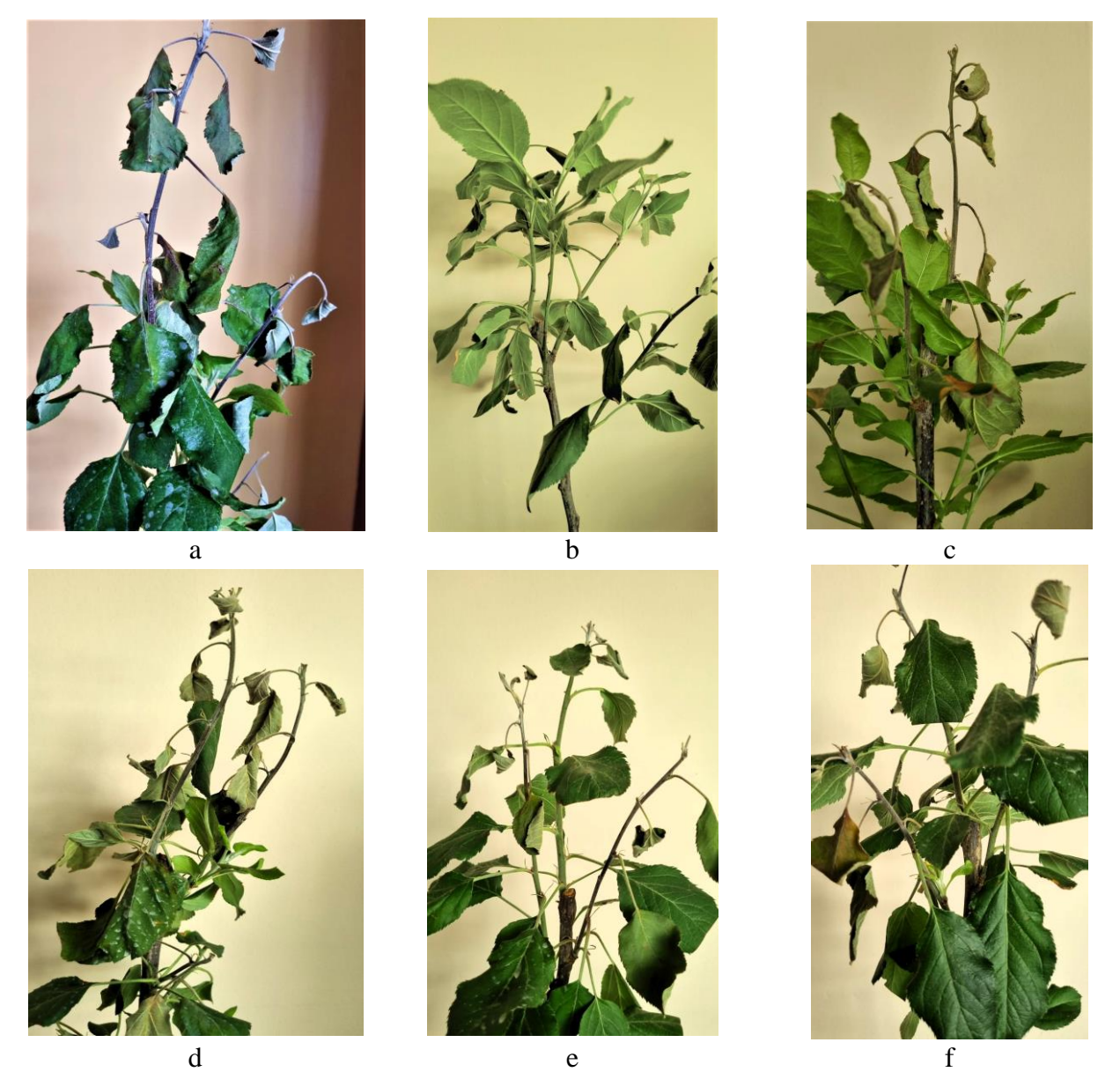
Figure 2. Shoot blight caused by Erwinia amylovora on apple plants cv. Gala with M9 rootstock, a) Control plants with only pathogen inoculation, Plants treated with b) Copper oxychloride, c) Copper sulfate, d) Copper hydroxide, e) Phosphorous acid, f) Bacillus subtilis QST713.