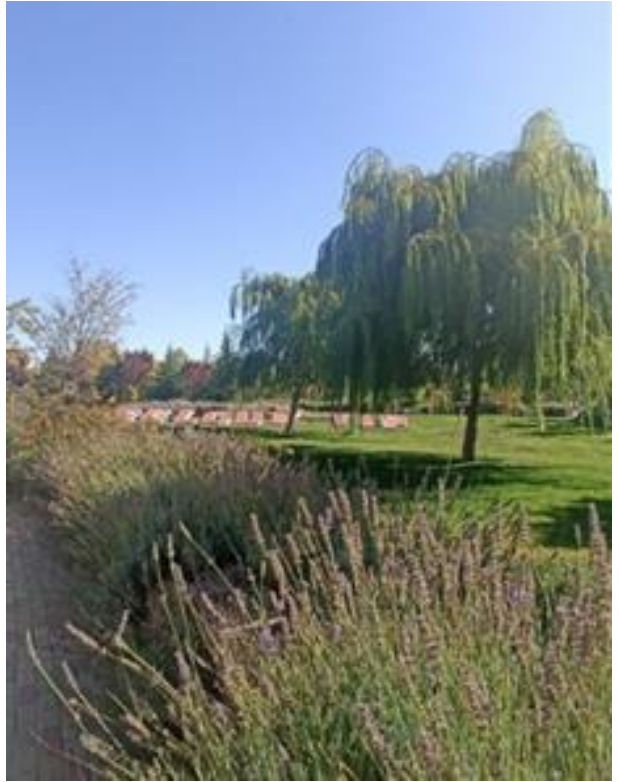
Figure 10. Example of the principle of contrast in the garden of Selcuk University Faculty of Medicine hospital