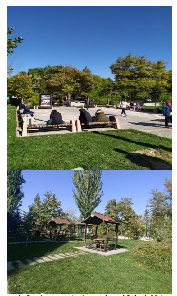
Figure 2. Seating areas in the garden of Selcuk University Faculty of Medicine hospital