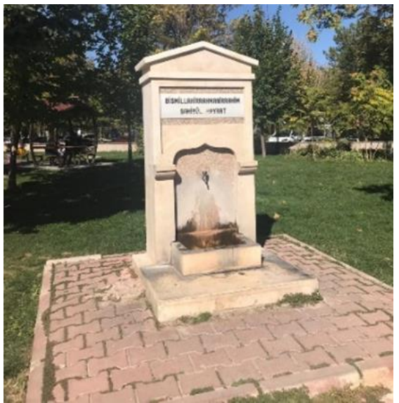
Figure 5. Water elements in the garden of Selcuk University Faculty of Medicine hospital