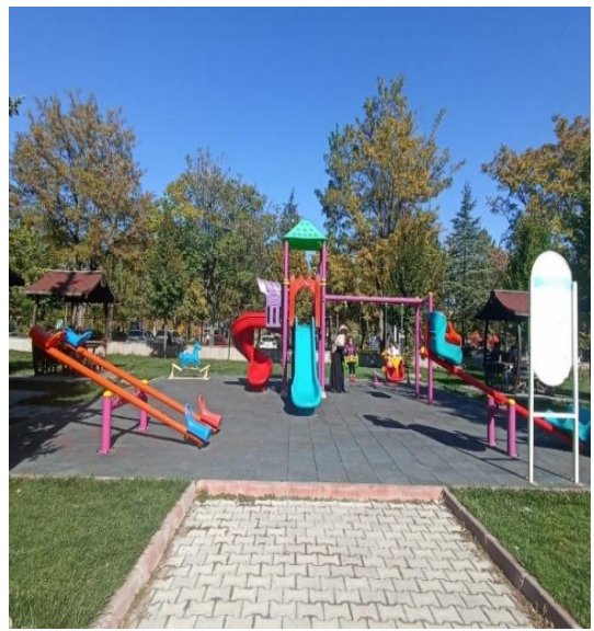
Figure 3. Children's playground in the garden of Selcuk University Faculty of Medicine hospital