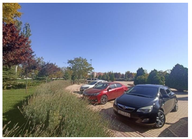
Figure 8. Example of repetition principle in the garden of Selcuk University Faculty of Medicine hospital

The principle of emphasis in the garden of Selcuk University Faculty of Medicine hospital was tried to be achieved through plants, water elements and sculptures. In the example in Figure 9, the emphasis principle was used with the color effect of Acer platanoides "Crimson King" (Maple with red sycamore leaves). Evergreen coniferous plants were used as the dominant species in the hospital garden. Especially Pinus nigra (Black Pine), Cupressus arizonica (Arizona Cypress) and Cedrus libani (Lebanon Cedar) are the dominant species.