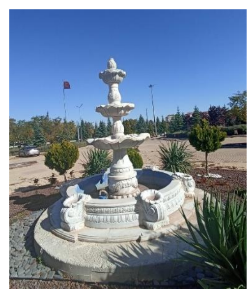
Figure 4. Floor covering in the garden of Selcuk University Faculty of Medicine hospital