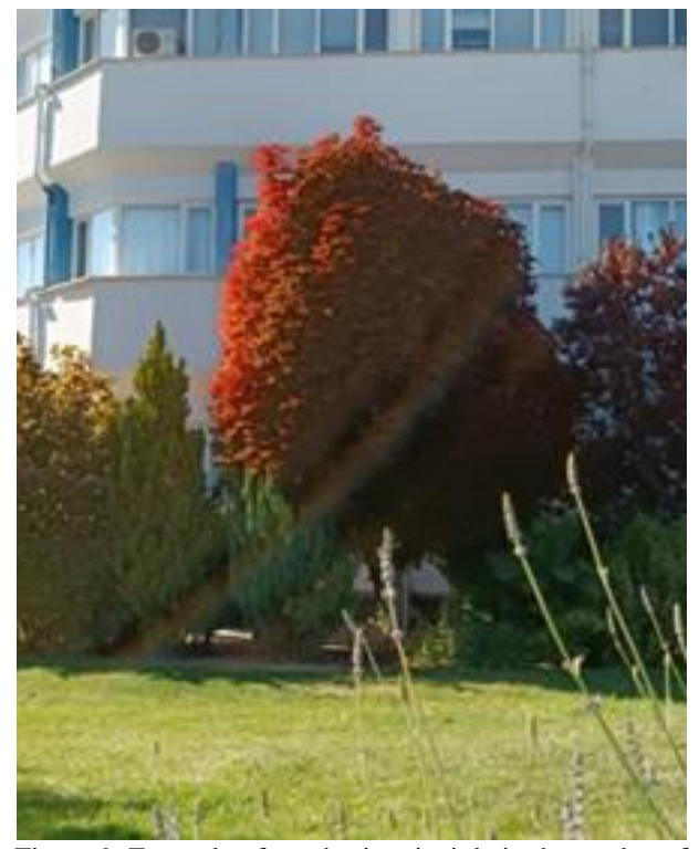
Figure 9. Example of emphasis principle in the garden of Selcuk University Faculty of Medicine hospital