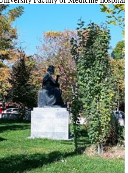
Figure 6. Ibn-i Sina statue in the garden of Selcuk University Faculty of Medicine hospital