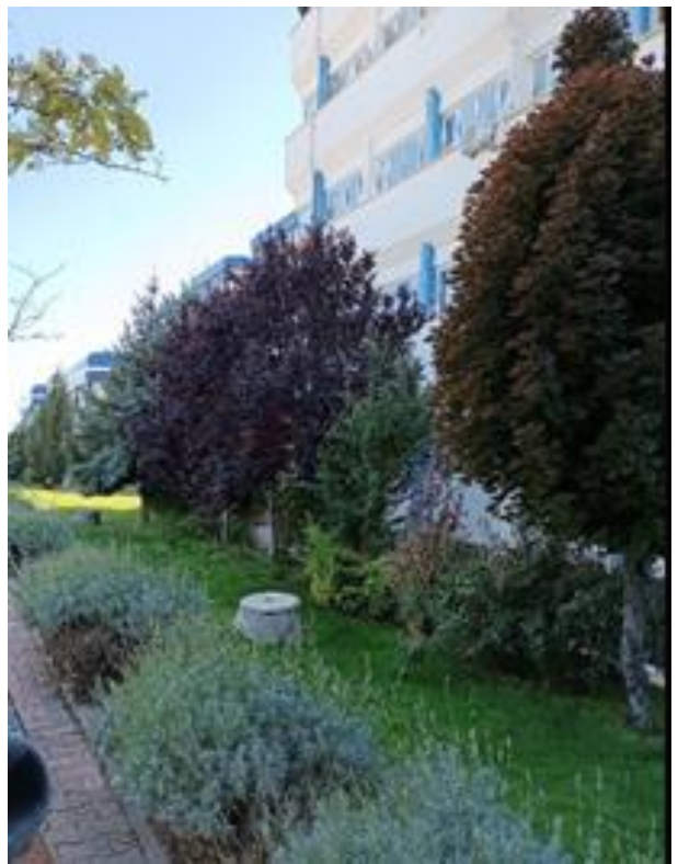
Figure 11. Example of variety principle in the garden of Selcuk University Faculty of Medicine hospital

Table 1. Evaluation of the Structural Landscape Design of Selcuk University Faculty of Medicine Hospital Garden